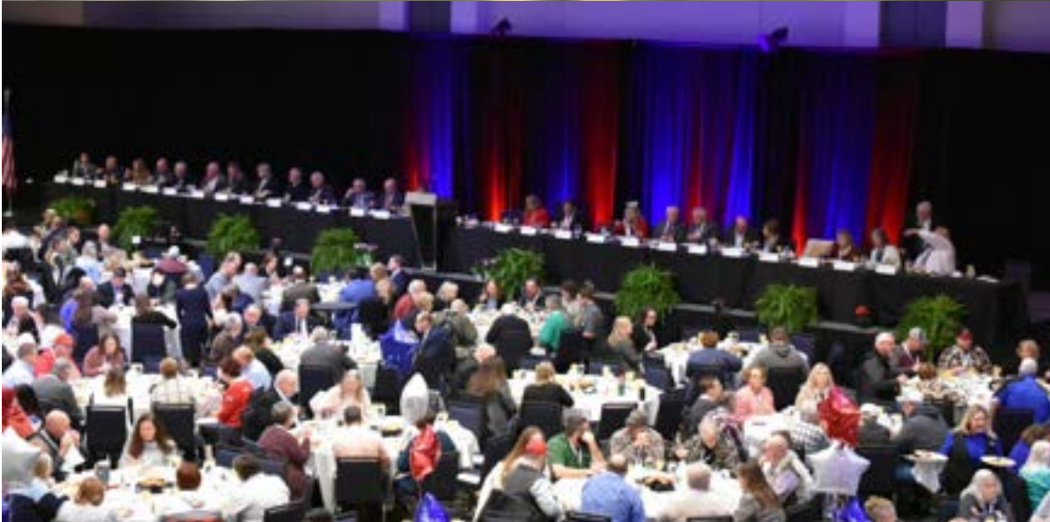
Top: 1900+ for the BIG PARTY 100th Anniversary Evening